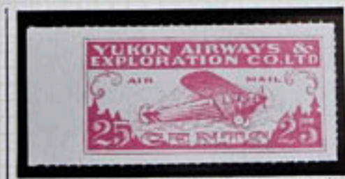
CL42F — NH. Magenta

Note the Likeness to the U. S. C. 10 of 1927.