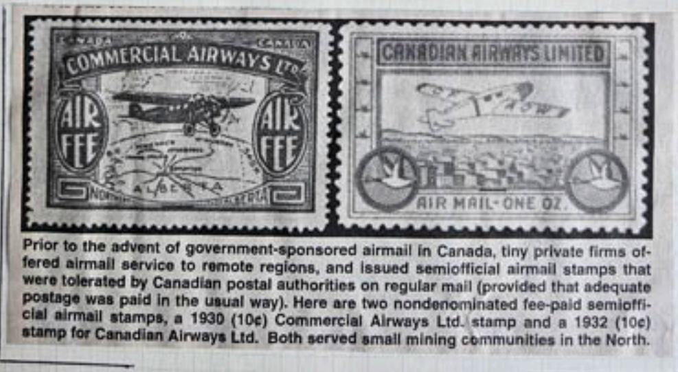
Prior to the advent of government-sponsored airmail in Canada, tiny private firms offered airmail service to remote regions, and issued semi-official airmail stamps that were tolerated by Canadian postal authorities on regular mail (provided that adequate postage was paid in the usual way). Here are two nondenominated fee-paid semi-official airmail stamps, a 1930 (10c) Commercial Airways Ltd. stamp and a 1932 (10c) stamp for Canadian Airways Ltd. Both served small mining communities in the North.