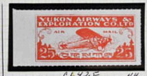
CL42F — NH. Red