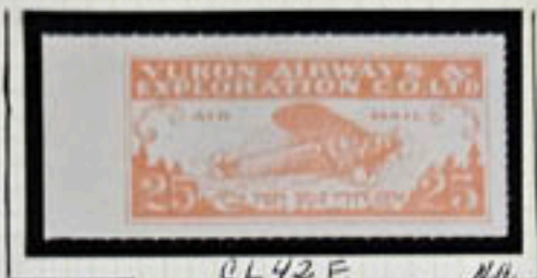
CL42F — NH. Orange

CANADA CL42 FORGERY 25c Yukon Airways FORGERIES. Set of 4, one each in the unauthorized trial colours of Orange, Red, Blue & Magenta. Interesting collateral material.