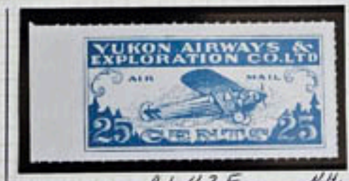
CL42F — NH. Blue