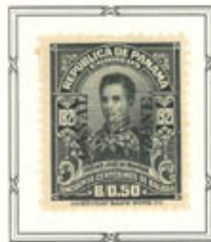
Jose de Fabrega

Like all her Latin American neighbors, Panama, in 1921, celebrated the centenary of her independence from Spain by issuing a set of postal stamps. Here, again, the Canal Zone postal service joined in the celebration by overprinting these stamps for use in the CANAL ZONE. The overprinting was by the American Bank Note Company.