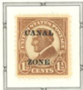
Warren G. Harding