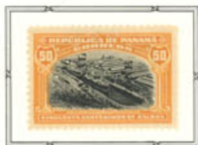
Drydock at Balboa

Fifty-cent and dollar denomination stamps were requested of the Panama Government on November 29, 1919, and again official photographs were furnished which were relayed to the American Bank Note Company. They were received, overprinted, and put on sale by the Canal Zone on September 4, 1920.