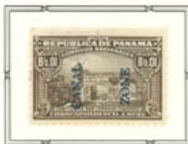
San Geronimo Castle Gate