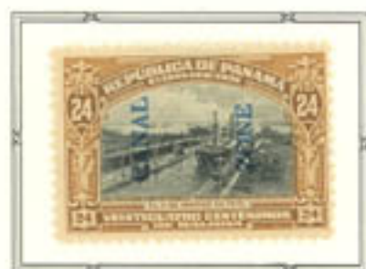
S.S. "Cristobal" in Gatun Locks

About a year later the need arose for higher denomination stamps in the Zone and the Director of Posts requested Panama stamps in the denominations of 12c, 15c, and 24c. Official Panama Canal pictures were furnished Panama as subjects for the stamps. The stamps went on sale in all Canal Zone post offices January 1917.