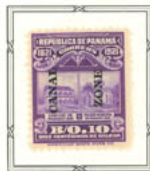
Municipal Bldg. in 1821 & 1921