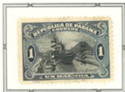
Ship in Pedro Miguel Locks

Fifty-cent and dollar denomination stamps were requested of the Panama Government on November 29, 1919, and again official photographs were furnished which were relayed to the American Bank Note Company. They were received, overprinted, and put on sale by the Canal Zone on September 4, 1920.