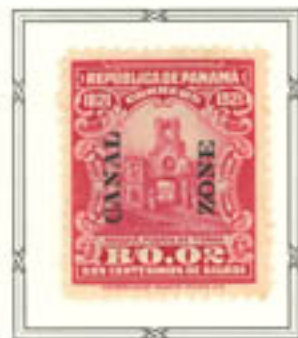
The "Land Gate"