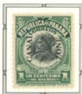
Vasco Nunez de Balboa