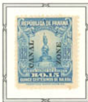
Statue of Balboa