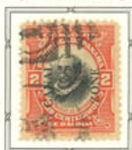
Francisco Hernandez de Cordoba