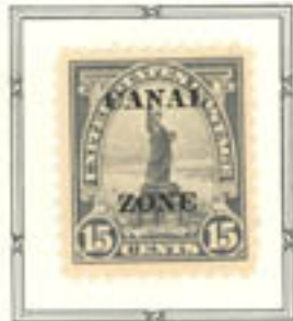
Statue of Liberty