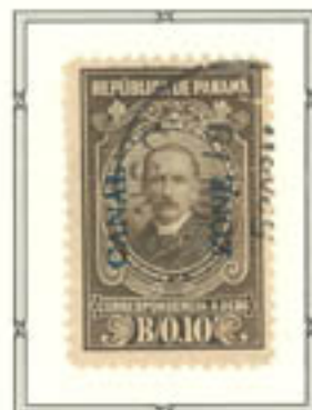
Pedro J. Sosa

Although Panama had no postage due stamps to this date, the use of United States Postage Due stamps overprinted "CANAL ZONE" was the cause of an exchange of letters between Canal Zone and Panama authorities. Panama claimed a contravention of the Taft Agreement. This new series of postage due stamps was the result.