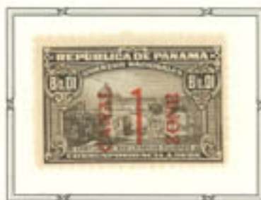
San Geronimo Castle Gate