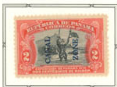
Balboa and Pacific Ocean