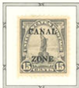
Statue of Liberty