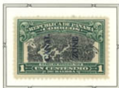
Map of Panama Canal