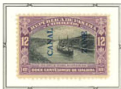
S. S. "Panama" in Culebra Cut