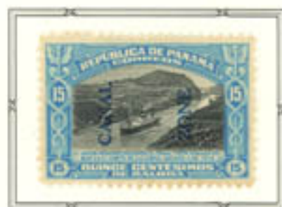
S. S. "Panama" in Culebra Cut